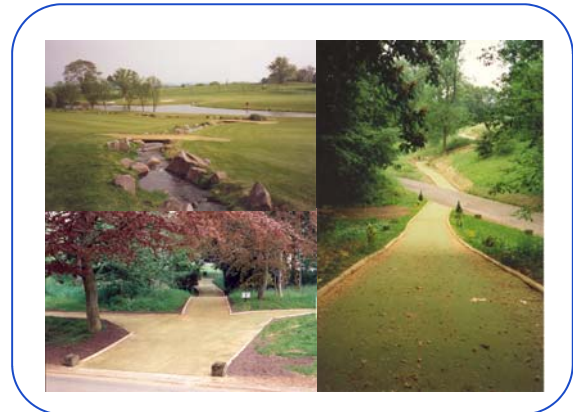
Water features and carpet paths created at the Welcombe Golf Course in Stratford-Upon-Avon.

Malcolm Grout, Head Greenkeeper, The Welcombe Golf Course, Stratford-Upon-Avon